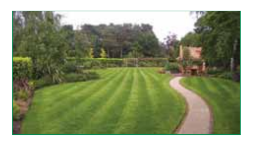
Make your neighbours "Simply Green" with envy