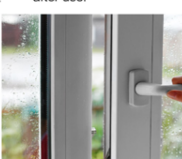
By Sarah Davey

High humidity can make a home prone to mould spores. Minimise humidity by ventilating or using a dehumidifier and treat mould on walls promptly. Consider having a fan fitted in the shower area or open a window and wipe down all wet surfaces after use.