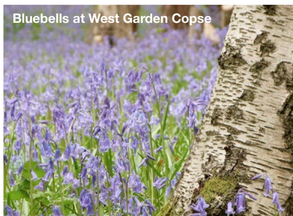
Bluebells at West Garden Copse

All events are free unless otherwise stated.