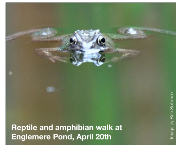
Reptile and amphibian walk at Englemere Pond, April 20th

Information about walking, cycling, orienteering, fishing and horse riding opportunities in the borough is also available on our website www.bracknell-forest.gov.uk/parks-and-countryside/outdoor-activities