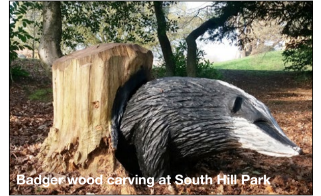
Badger wood carving at South Hill Park

Meet: Courtyard in front of SHP reception, South Hill Park, Ringmead, Bracknell, RG12 7PA.